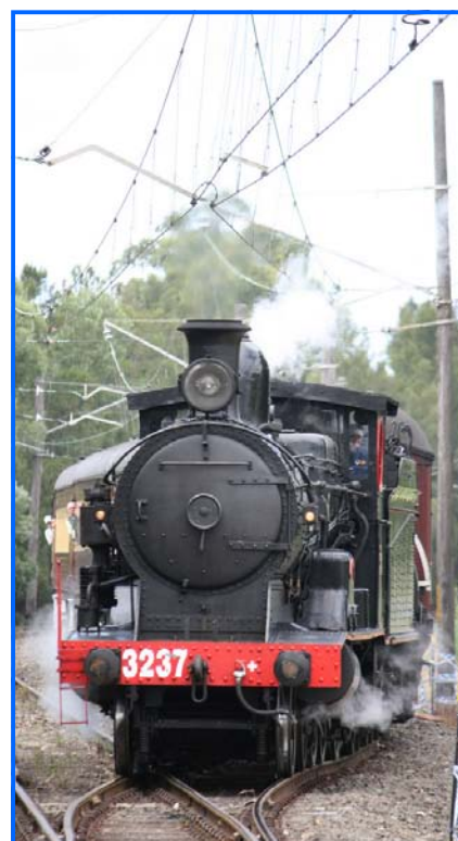
Photo: P Class Veteran Steam Locomotive 3237 to be conducting trips around the Bankstown Line in May. Sohtaki Kikuchi

Our package includes your train ticket, coach transfer, main course and desert or cheese meal tickets, and commemorative Lovedale Long Lunch tasting glass.